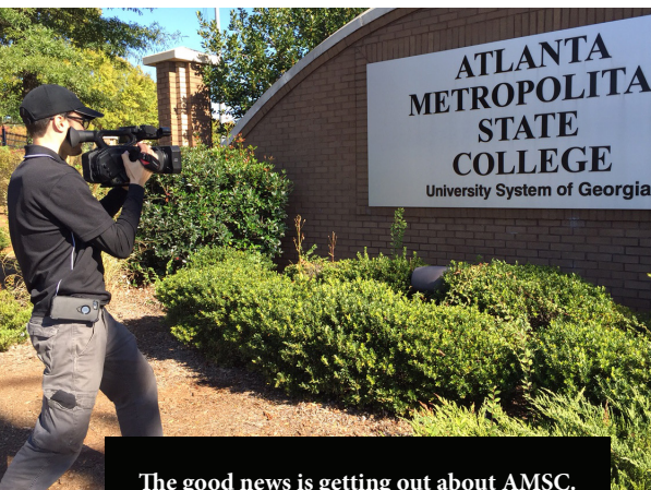
The good news is getting out about AMSC.

In 2017 the Office of Institutional Advancement was restructured and renamed the Office of Strategic Marketing and Advancement. This change signals a fresh emphasis on branding and marketing strategy that advances fundraising initiatives, brand awareness and engagement, and relationship cultivation. In short, the college has begun to aggressively tell its story with a vision to catapult AMSC to unprecedented levels of accomplishment and distinction.