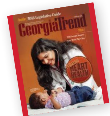
Atlanta Metropolitan College Foundation, as seen in Georgia Trend

The Celebration of Leadership Awards received robust support from the Atlanta business community with Delta Air Lines as the top contributor.