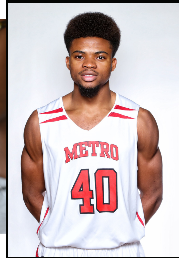
The men's and women's Trailblazers represent AMSC well, both on the court and in the classroom.